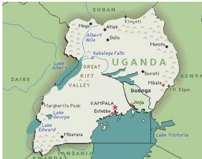
Figure 1 Map of Uganda showing area of our operations

Many local pastors, healthcare workers and nurses attended. A core of local business people and government officials donated time and funds to implement the project.