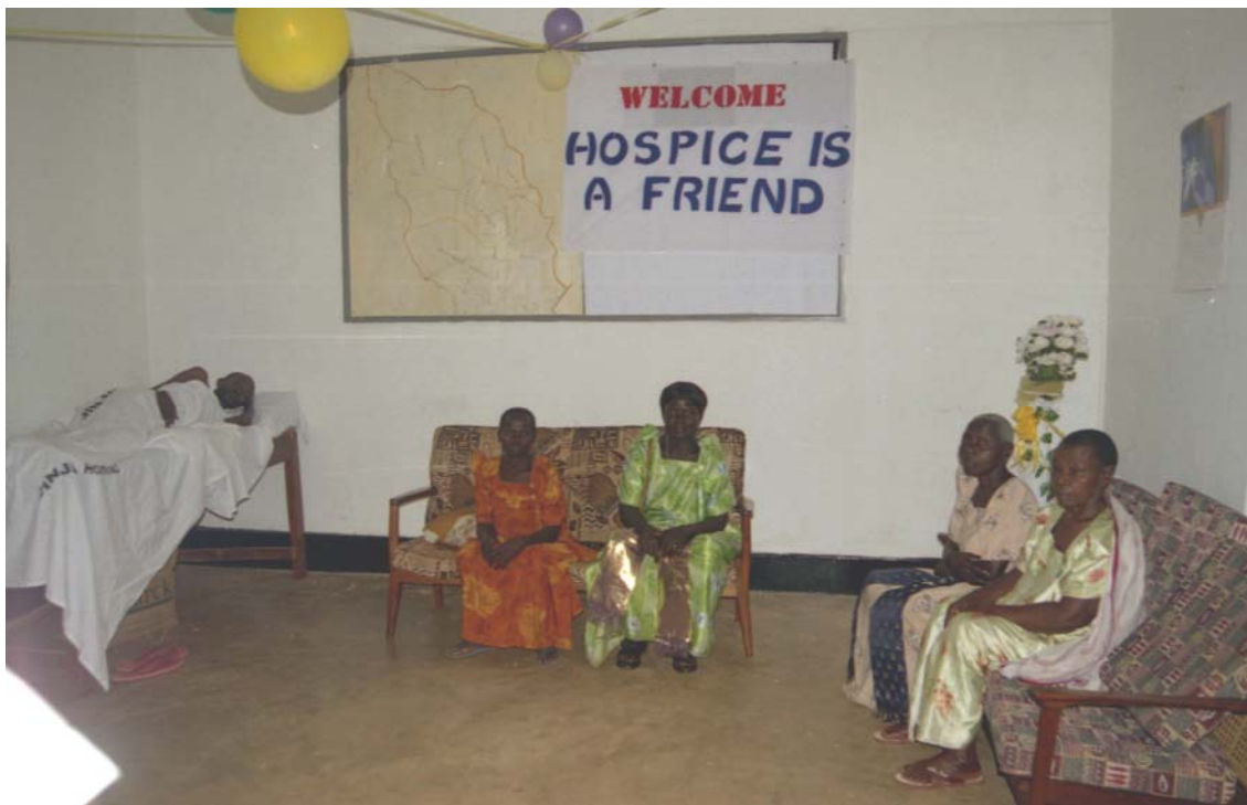
Figure 7 Patients at Hospice Jinja

This home based program is in need of operation funding to buy medicine, office supplies, pay utility bills, a vehicle for our staff and financial reimbursement for our volunteer's travel expenses. Many of our patients are extremely poor. They cannot afford to pay for the basic medical supplies that they need. We desperately need to raise the $30,000 balance toward 2005/2006 Budget. I need your help to locate the funding. If you know someone, a church, club, association, corporation that has a caring heart and desire to help, please let us know.