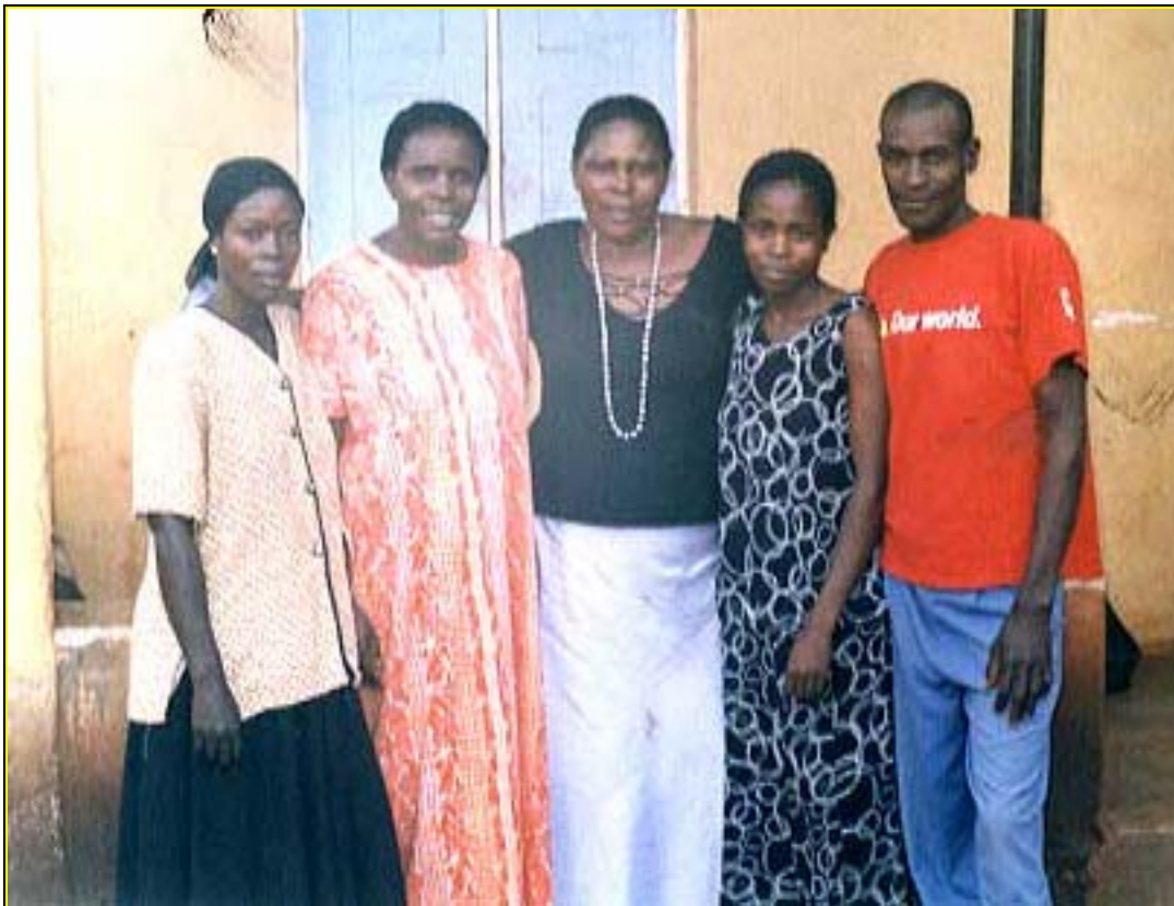
Leaders of Bugembe Ministry

Bugembe faith ministry programme has a number of leaders whose main work is advocacy.