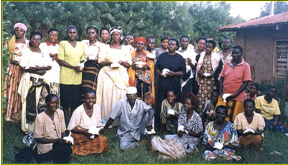
Some of Bugembe women

Bugembe Women of Faith programme is comprised of women, mostly widows, children both HIV infected and orphaned to HIV/AIDS. There are about 100 children.