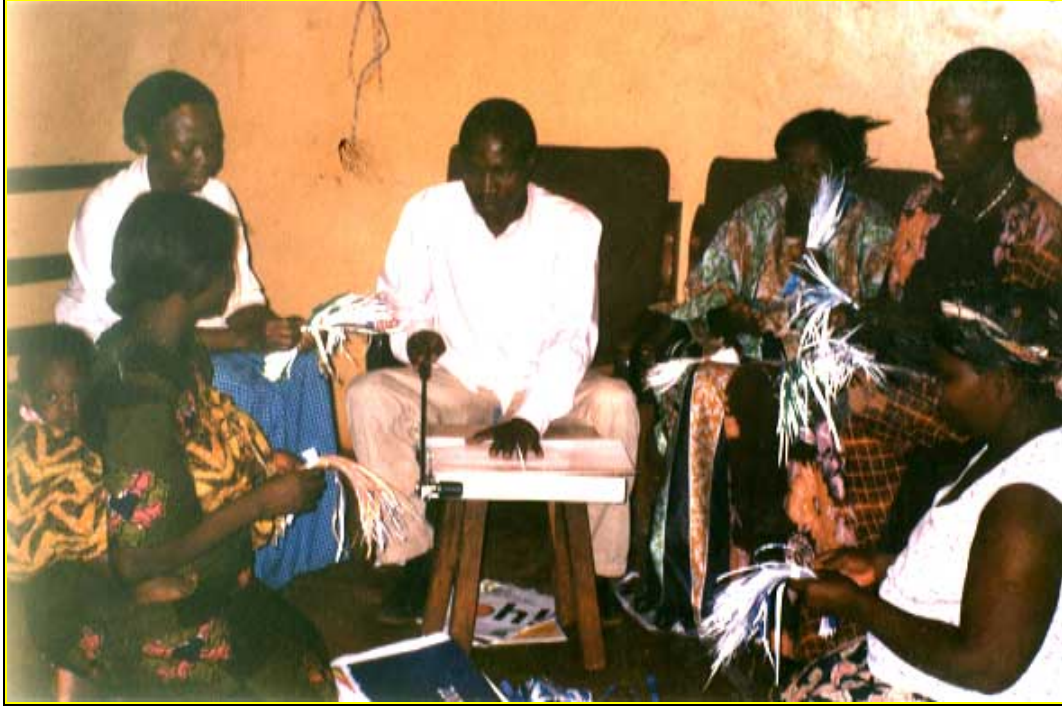
Bugembe women making hand crafts out of paper