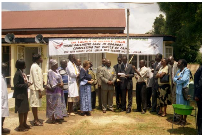
Opening Hospice Jinja