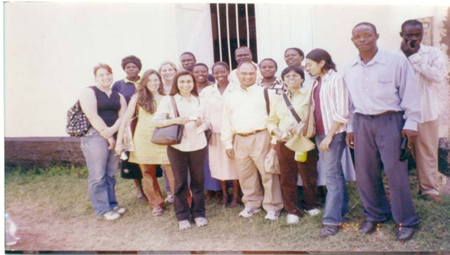
Hospice Jinja Staffs and the visitors from Himalayan Institutes and VITAS